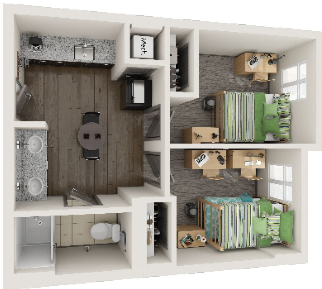
BEDROOM 1 BED A (single)